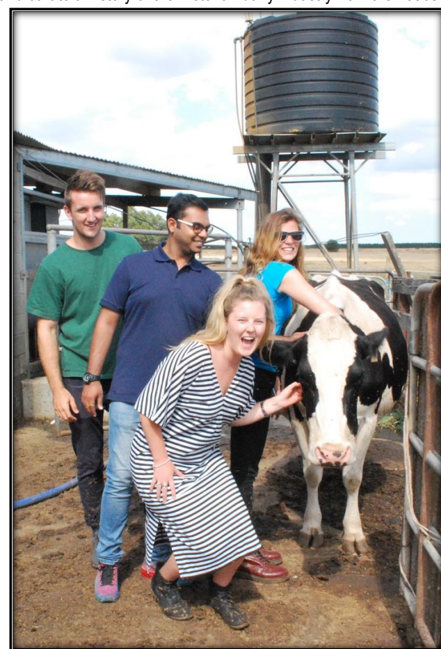
The MITI team conducting on farm research in Western Victoria.