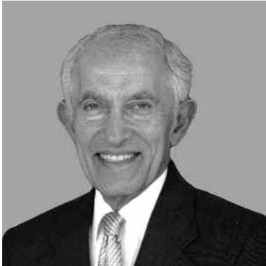
Professor David de Kretser AC Governor of Victoria PATRON OF THE GEOFFREY GARDINER DAIRY FOUNDATION LIMITED

Professor David de Kretser's academic career has bridged medicine and anatomy having held positions at Monash University as Professor and Chairman of Anatomy, Founding Director of the Monash Institute of Reproduction and Development and Associate Dean for Biotechnology Development.