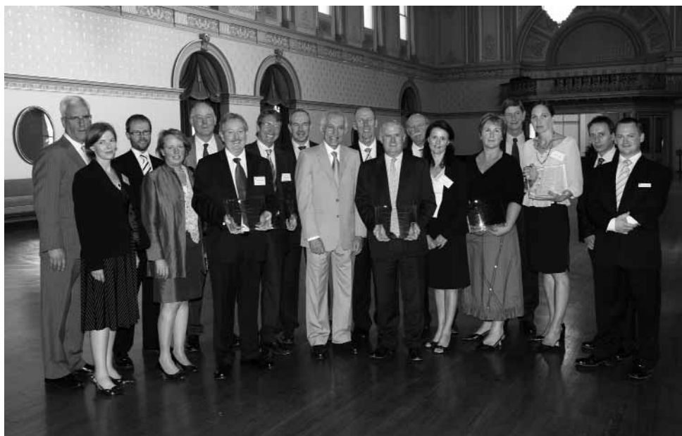
At the launch of the Dairy Health and Nutrition Consortium at Government House by Professor David de Kretser AC, Governor of Victoria.

Increasing dairy food consumption in children